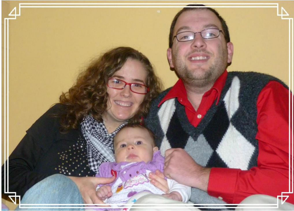
BOYCES IN CHILE